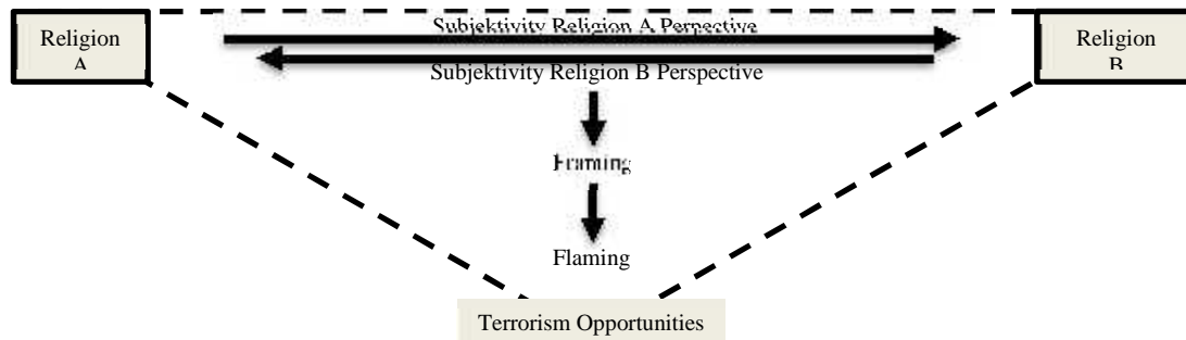
Figure 3: The cross-theological debate produced terrorism opportunities