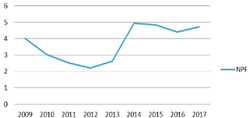
Figure 1. The Non Performing Financing Trend 2009 – 2017

In addition, from the same source, it is known that the growth of Islamic banks in recent years is also not in good condition. Figure 2 shows the asset growth chart of Islamic banks from year to year which has been declining since 2009. The decline in asset growth began in 2011 until 2015 and it started to rise from 2015 ahead. Although the value of Islamic bank assets continues to increase every year, but in reality the growth of Islamic bank assets is weakening.